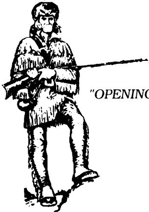
"OPENING THE WEST"